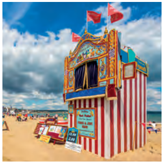
Punch and Judy