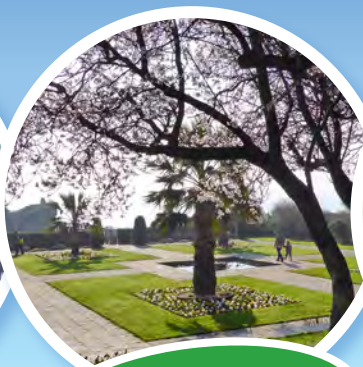
Fabulous Parks and Gardens