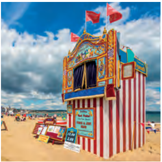
Punch and Judy