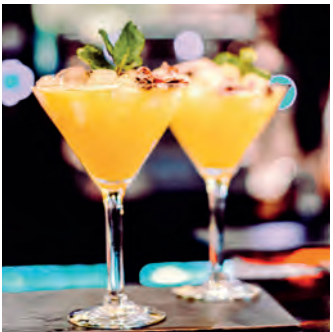
Cocktails by the Beach