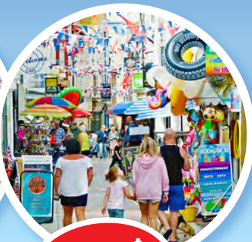
Vibrant Town Centre