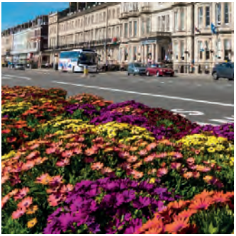
Weymouth In Bloom